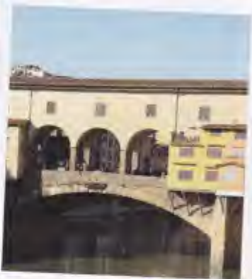
The picturesque Ponto Vecchio bridges the two halves of the city

its compact size, there's no shortage of things to see and do. A must-see is Michelangelo's David, situated in the Accademia Gallery, which is simply awe-inspiring. Another must is the Uffizi Gallery, home to Botticelli's The Birth of Venus and Renaissance masterpieces by Titian, Giotto and Caravaggio. Widely considered to be the greatest collection of Renaissance art in the world, you won't fail to be moved